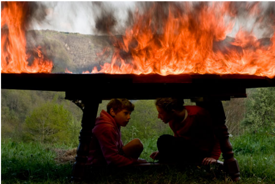
Lalala, 2011

This biennial festival, 10th - 12th October 2014, is a collaboration between arts organisations in the UK and Northern France and showcases acclaimed international artists alongside emerging talents over the three days. It has a carefully honed programme encompassing work by British and French artist filmmakers, and has a mission to create out-of-the-ordinary cinematic experiences of the kind you won't find in traditional cinema.